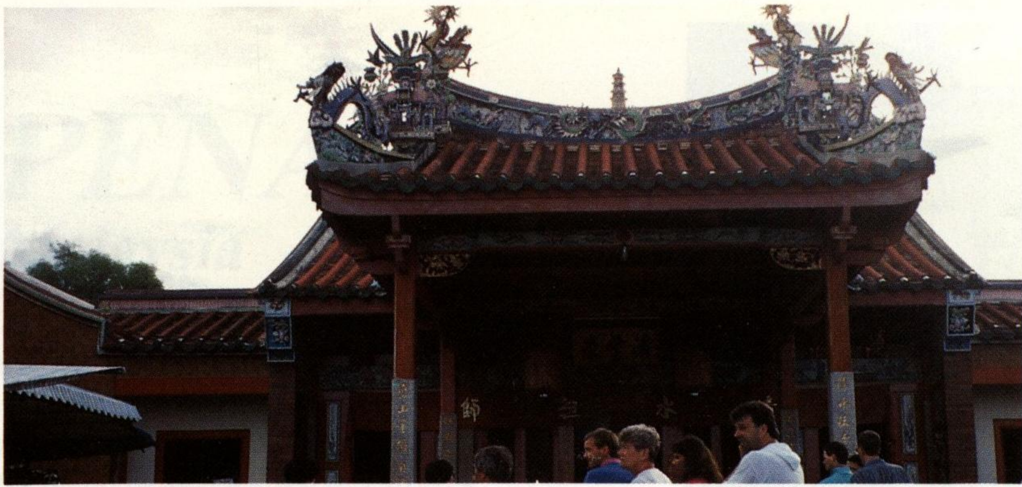
The Snake Temple, built in 1873, is home to poisonous pit-vipers, who freely come and go among the worshipers offering prayers and visitors snapping photographs. The snakes are rendered drowsy and "safe" by the heavy fumes of the incense.